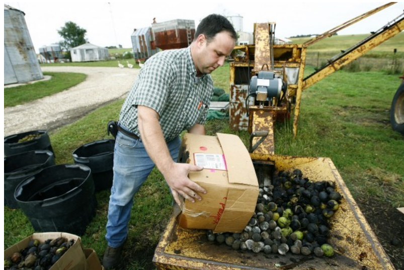
Black Walnut Hulling

As always, admission is donation based, however, packages are available that include a few extras (wagon ride, scarecrow making & a pumpkin to take home)