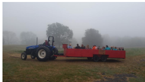
Fall Fun Wagon Ride